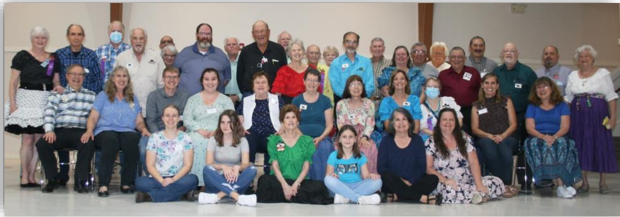
Brazos Bottom Belles and Beaus members, students and friends getting ready for the Halfway Dance on Tuesday, May 4th at 7:00 pm. Come join us!