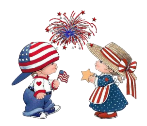
We love having visitors... Come by and join in the fun

* [We will dance at Chapelwood UMC, 11140 Greebay Street, Houston, on the dates with an asterisk ]