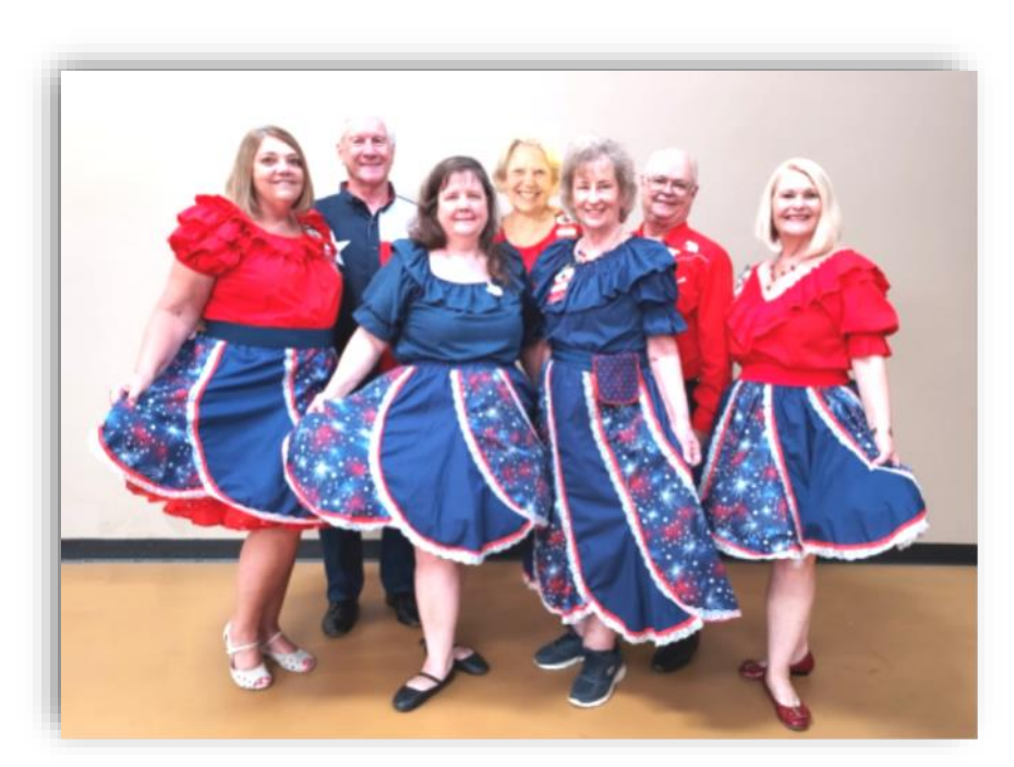
2024 ELECTED BOARD MEMBERS